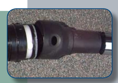
Easy, safe and quickly exchangeable clip hose connections.

5-Caster Wheel Design For Superior Maneuverability