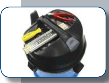
Convenient large storage area on the turbine head.