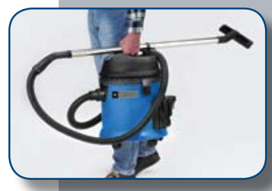
Mobile and lightweight, perfector multiple locations.