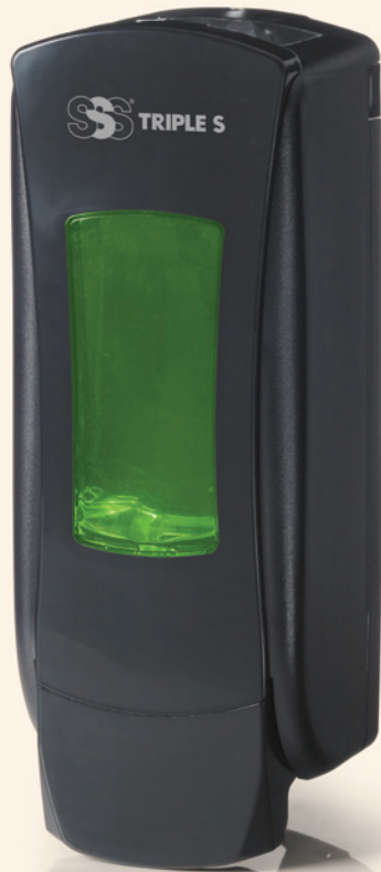
1250 mL MANUAL DISPENSER Available in Black or Gray