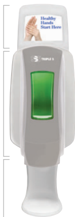
Shown with 1250 mL Dispenser

SHIELD Floor & Wall Protector 1045-WHT-12