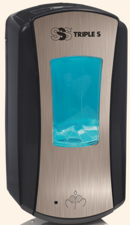
1200 mL TOUCHFREE DISPENSER Available in Gray/White, Black/Chrome or Black

Open cabinet using one of the dual side latches, or convert to a locking cabinet by removing the key inside. Change your mind anytime simply by replacing key.