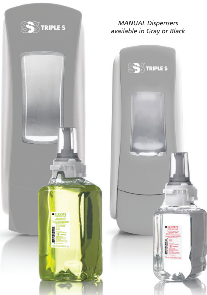
MANUAL Dispensers available in Gray or Black

1250 mL MANUAL SYSTEM 4.5" w x 11.75" h x 4" d