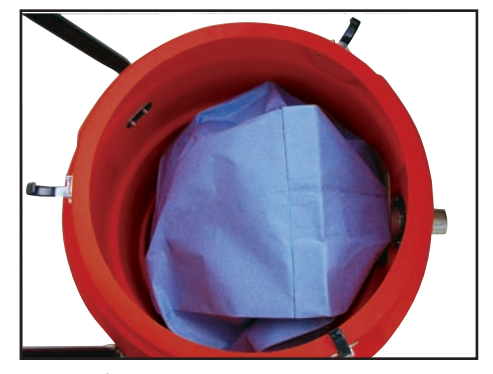
High efficiency 2-ply enclosed, disposable paper filter bag acts as the primary filter to trap and hold dry material for easy handling and disposal. (B524253)

Wet pickup adapter with reliable float shut-off (B260200)