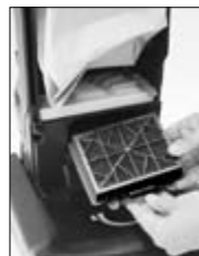
3) HEPA exhaust filter