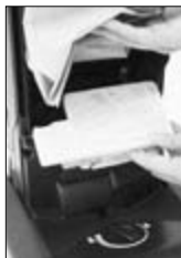
2) Motor filter