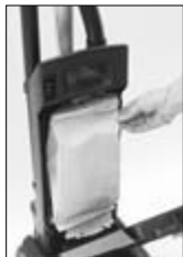
1) Top-filling, poly-lined two-ply paper filter